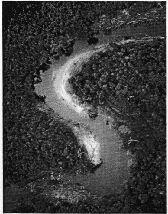
Figure 2. Aerial photograph of upper Macal showing floodwater devastation in May 1990.

Crocodiles were located from two-man canoes at night using 12-volt headlights to detect eyeshine reflections. All animals sighted or captured were classified by total length (TL) as hatchlings (<35.0 cm), juveniles (35.1 to 75.0 cm), subadults (75.1 to 140.0 cm), or adults (>140.1 cm); individuals that could not be approached close enough to estimate TL were classified as 'eyeshine only' (EO). Following Bayliss (1987), the number of crocodiles encountered per km of survey route was used as a measure of relative density (Platt & Thorbjarnarson, 2000b). Distance traveled on the river was calculated with a Magellan Global Positioning System (GPS) 2000 satellite navigator and confirmed using UTM 1:50,000 topographical maps of the area. At each of the main survey sites we recorded air temperature (AT), water temperature (WT), and an estimation of mid-stream flow rate by measuring the distance covered in 30 seconds by a small rubber ball. Evidence of nesting activity along the route was also investigated by searching suitable sites.